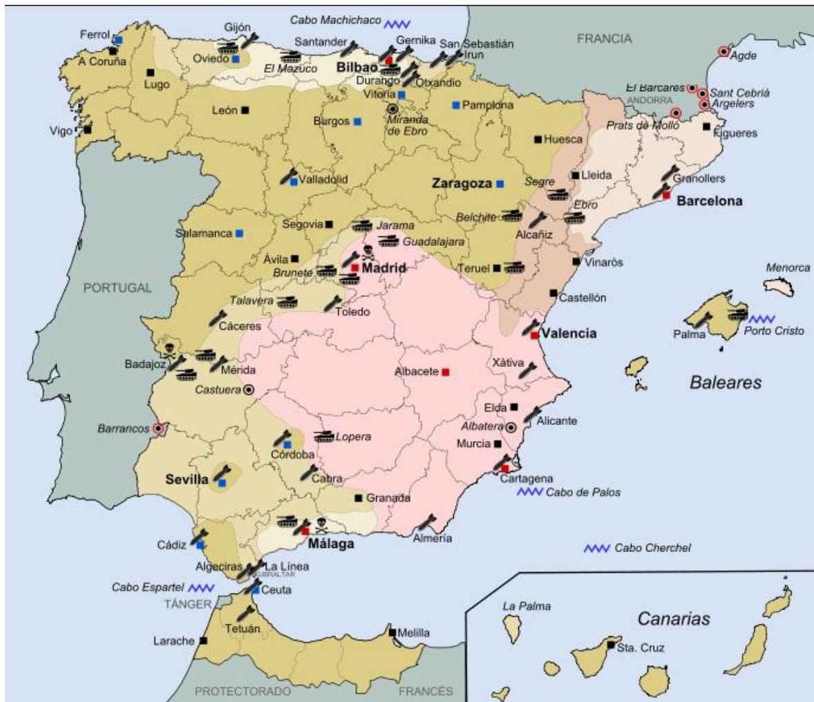
General map of the Spanish Civil War (1936–1939).